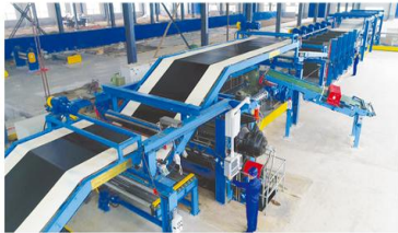
New 2300mm Hot Laminating Extruding Calender Machine