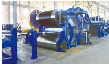
1900mm Roto Cure Machine