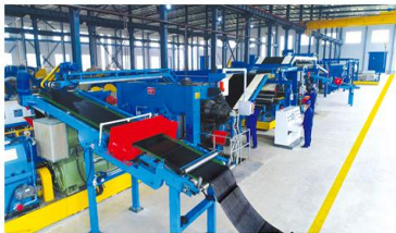
New 2300mm Hot Laminating Extruding Calender Machine