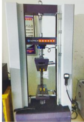
New Gotech Tensile Strength Testing Machine