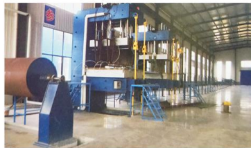
New 630mm Sidewall Belt production lines