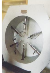
Pipe Belt testing Machine